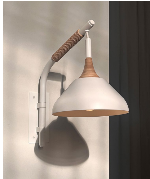
Stem Shade Mini Pivot Sconce pictured with White Powder Coat metal finish and Natural Leather coiling