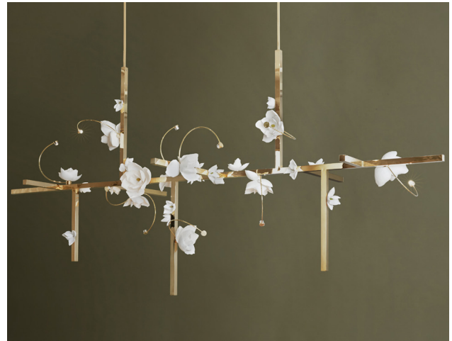
Pictured in Polished Bronze with White Magnolia Flowers

*Lure Chandeliers are one of a kind and can be fully customized to fit specific project needs. Feature this light in a lobby/retail setting, as a dramatic accent over a dining table, or a vertical lighting sculpture in a stairwell.