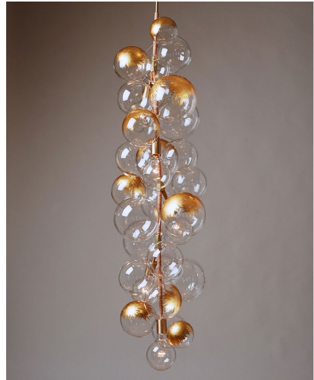
Pictured with Satin Brass metal finish, Natural Leather coiling and mix of 24k Gilded and Clear globes