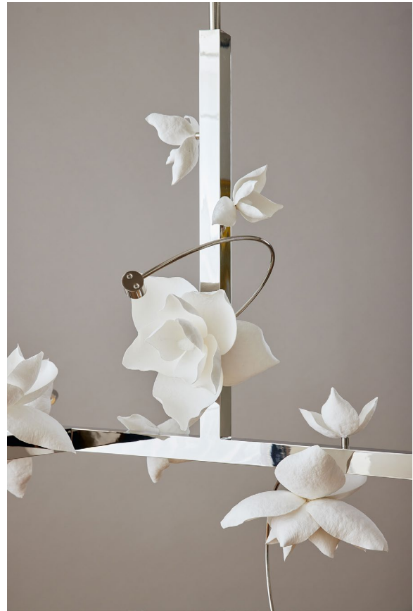
Lure Chandelier detail

The Lure can be made into a single pendant fixture, a wall installation, or grouped together into a suspended ceiling fixture.