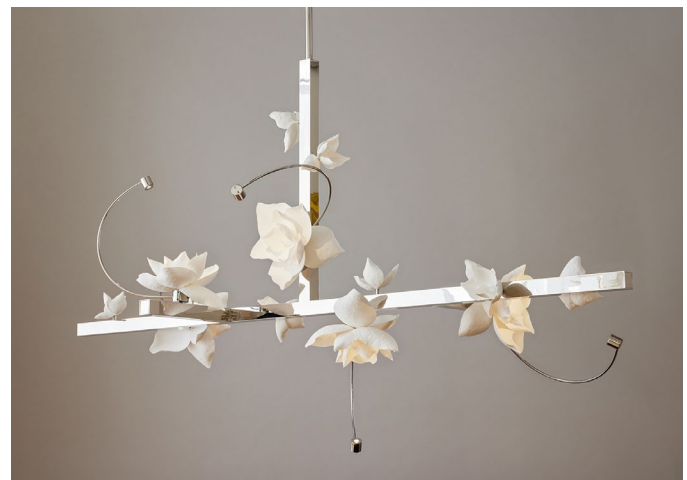
Custom Lure Chandelier 4 with Polished Nickel metal finish and White flowers