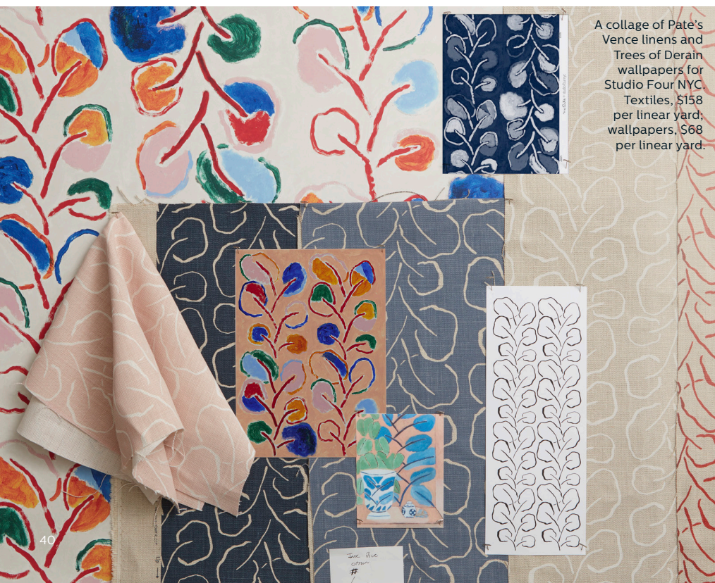
A collage of Pate's Vence linens and Trees of Derain wallpapers for Studio Four NYC. Textiles, $158 per linear yard; wallpapers, $68 per linear yard.