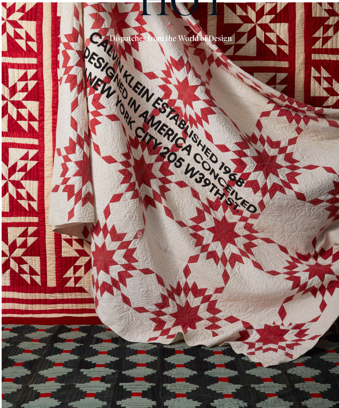
In two seasons as the creative director of Calvin Klein, Raf Simons has put his sly, intellectual twist on American fashion tropes. He's now doing the same for American homes, sourcing one-of-a-kind vintage quilts, some with added embroidery winking at the location of the brand's New York showroom. Background: Vintage star quilt. Center: Vintage embroidered star quilt. Bottom: Vintage log-cabin quilt. Prices upon request; available at Calvin Klein's Madison Avenue flagship store in New York.