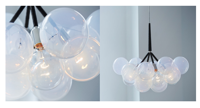
X-Large Bubble Chandelier with Opalescent glass, Polished Nickel and Black Leather Cord coiling.

In addition to the standard clear mouth blown glass, opalescent glass globes are also available upon request. Upgrade fees apply for Opalescent finishes per globe depending on globe size. Please inquire the studio for current pricing/availability.