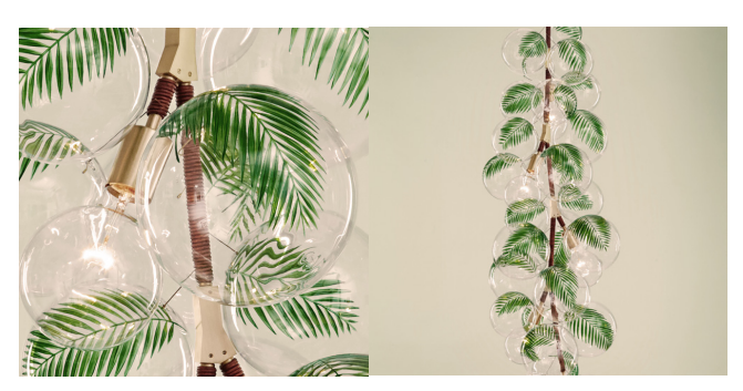
X-Tall Bubble Chandelier with Palm Leaf motif, Satin Brass and Dark Brown Leather Cord coiling.

For a very special and unique touch, hand-painted glass globes with custom motifs are available upon consultation with the studio. Please inquire for current pricing.