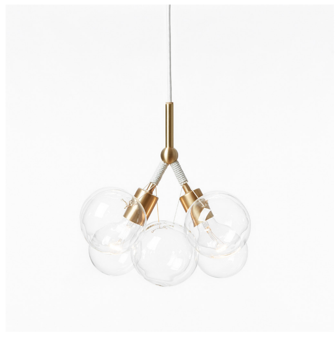
Pictured with Satin Brass Finish and Natural Cotton Cord