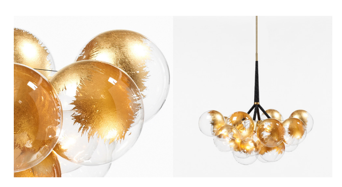
X-Large Bubble Chandelier with 24k Gold Leafing, Satin Brass and Black Leather Cord coiling.