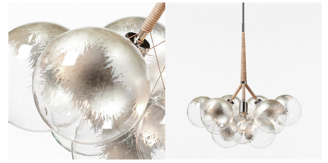
Large Bubble Chandelier with Silver Leafing, Polished Nickel and Natural Leather Cord coiling.

Any Bubble Chandelier can be customized with 24k Gold or Silver Leafing. Genuine gold or silver leaf is expertly applied by hand onto the surface of each glass globe. Variations in composition and coverage will occur throughout the light fixture. Upgrade fees apply for gilded finishes per globe depending on globe size. All glass globes or only a specific amount of globes can be gilded depending on desired effect. Please inquire the studio for current pricing/availability.