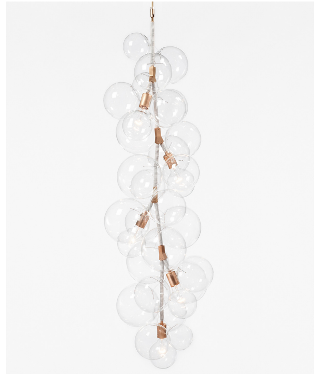
Pictured with Satin Brass and White Leather Cord