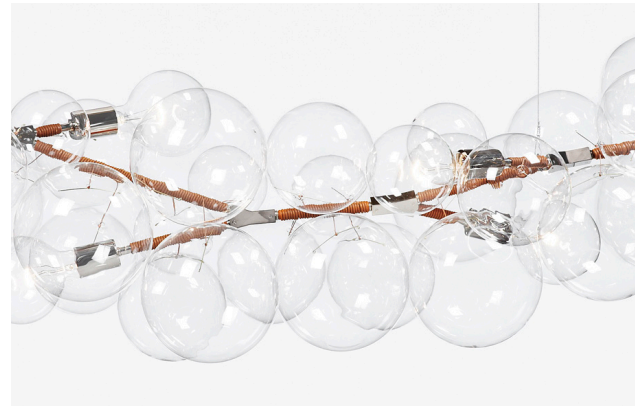
Detail of Polished Nickel, Henna Leather Cord, Figure 1 suspension configuration