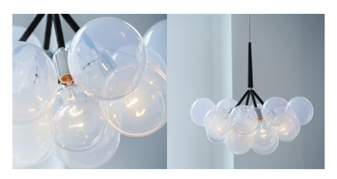
X-Large Bubble Chandelier with Opalescent glass, Polished Nickel and Black Leather Cord coiling.

In addition to the standard clear mouth blown glass, opalescent glass globes are also available upon request. Upgrade fees apply for Opalescent finishes per globe depending on globe size. Please inquire the studio for current pricing/availability.