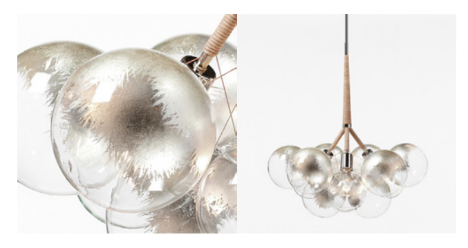
Large Bubble Chandelier with Silver Leafing, Polished Nickel and Natural Leather Cord coiling.

Any Bubble Chandelier can be customized with 24k Gold or Silver Leafing. Genuine gold or silver leaf is expertly applied by hand onto the surface of each glass globe. Variations in composition and coverage will occur throughout the light fixture. Upgrade fees apply for gilded finishes per globe depending on globe size. All glass globes or only a specific amount of globes can be coiled depending on desired effect. Please inquire the studio for current pricing/availability.