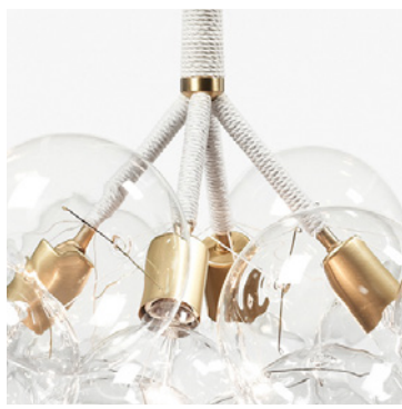
Option 1: Polished Nickel