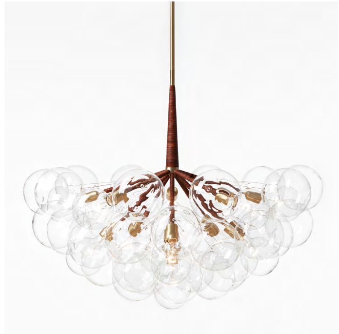
Supra Bubble Chandelier pictured with Satin Brass metal finish and Dark Brown Leather coiling