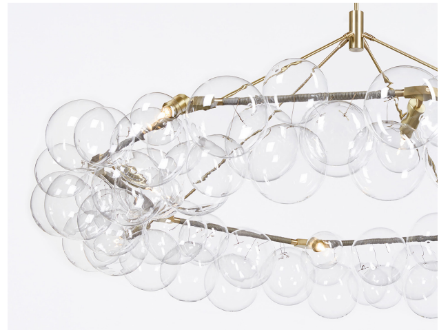
Detail of Satin Brass and Gray Leather Cord