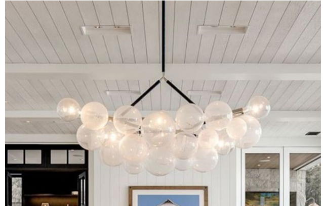
Pictured with Opalescent Globes, Polished Nickel and Black Leather Cord