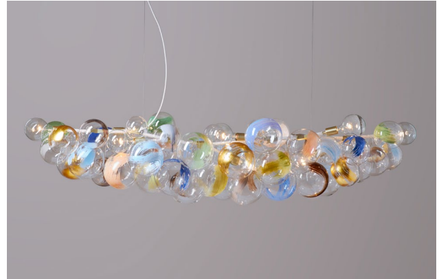
Pictured with Satin Brass, Cotton Coiling and Hand-painted Strokes Finish