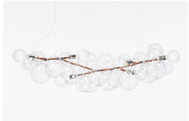
Pictured with Polished Nickel and Henna Leather Cord