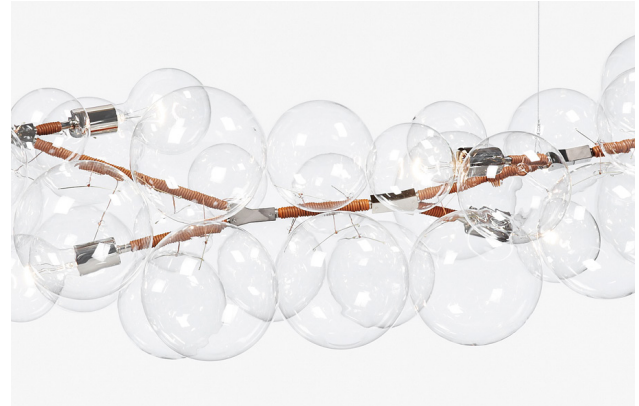
Detail of Polished Nickel, Henna Leather Cord, Figure 1 suspension configuration