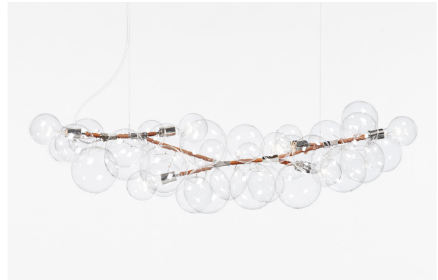
Pictured with Polished Nickel and Henna Leather Cord