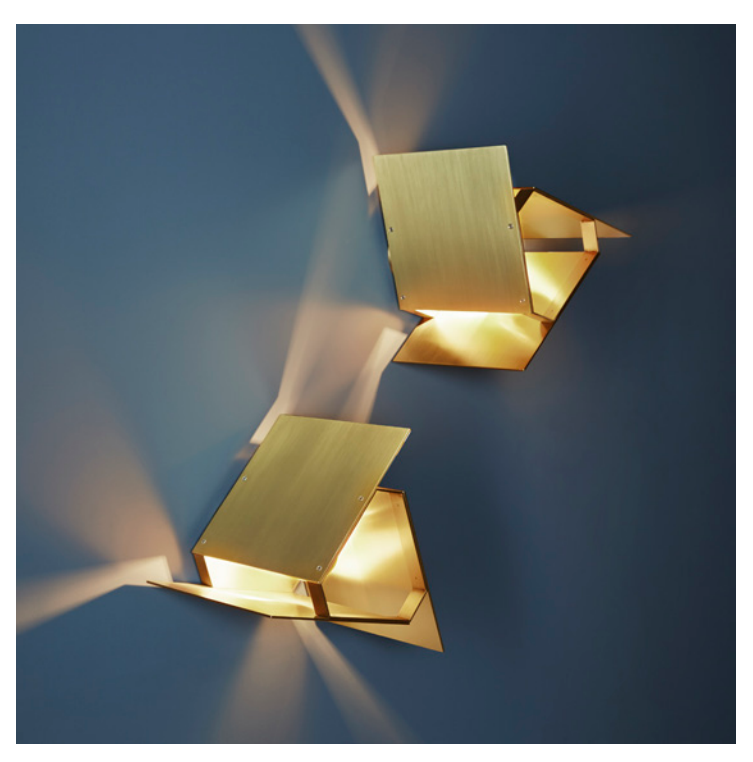
Pictured with Satin Brass