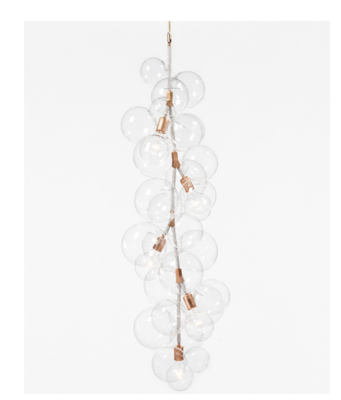
Pictured with Satin Brass and white Leather Cord Coiling Upgrade