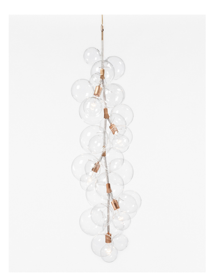
Pictured with Satin Brass and white Leather Cord coiling upgrade