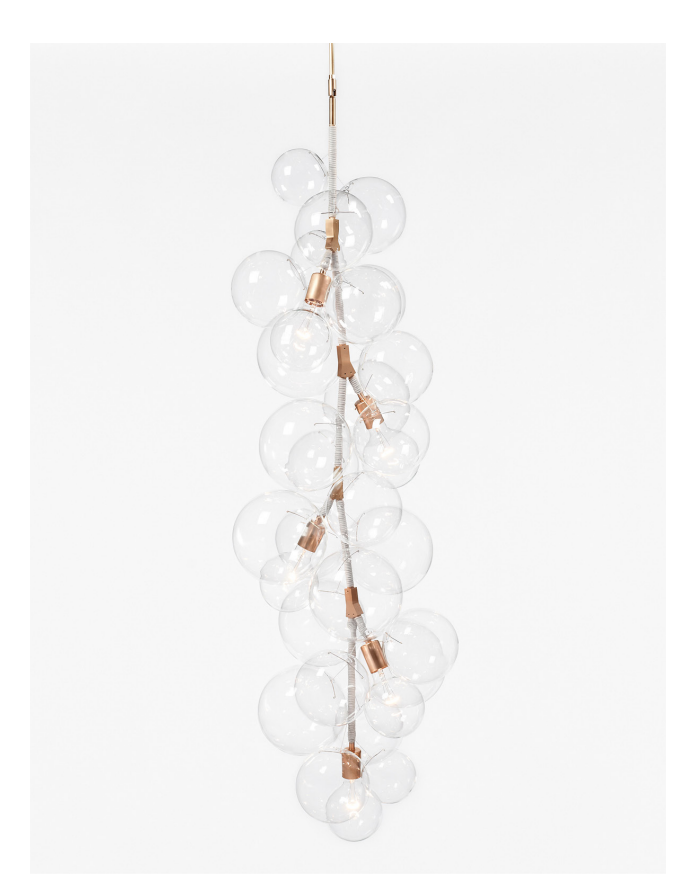
Pictured with Satin Brass and white Leather Cord coiling upgrade