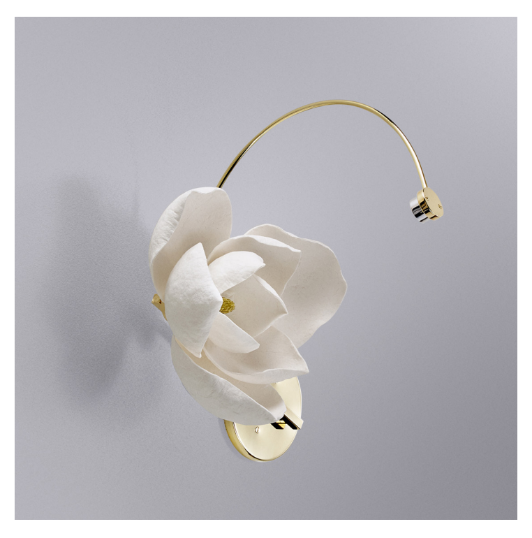
Pictured in Polished Brass with White Magnolia Flowers