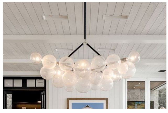
Pictured with Opalescent Globes, Polished Nickel and Black Leather Cord