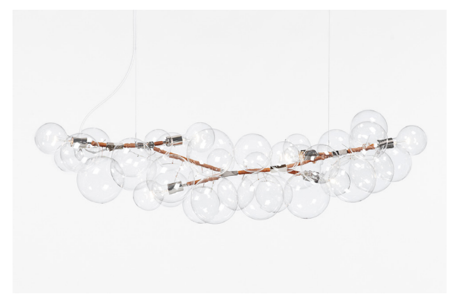
Pictured with Polished Nickel and Henna Leather Cord