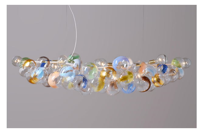
Pictured with Satin Brass, Natural Cotton Cord and Hand-painted Strokes Finish