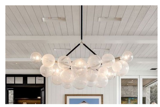
Pictured with Opalescent Globes, Polished Nickel and Black Leather Cord