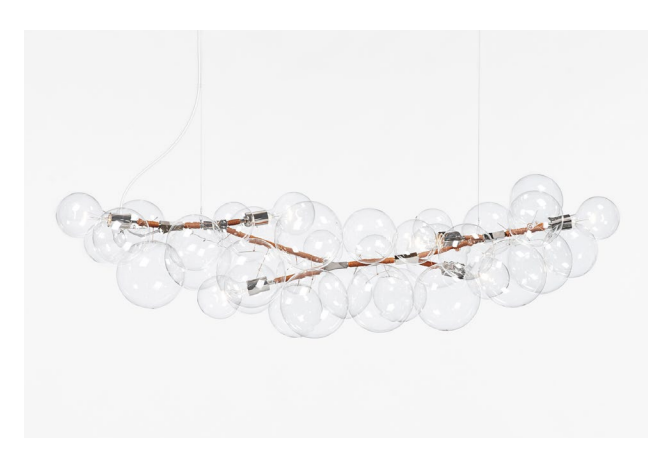
Pictured with Polished Nickel and Henna Leather Cord