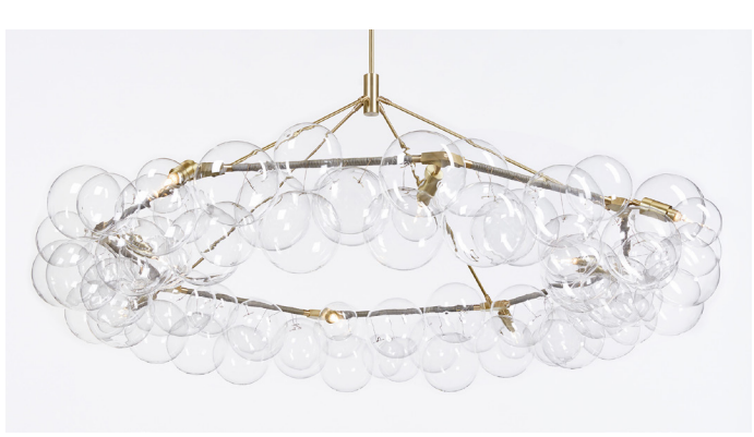
Pictured with Satin Brass and custom Gray Leather Cord Coiling